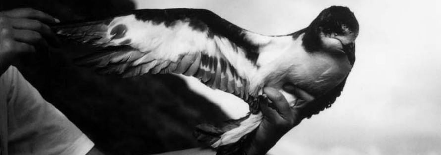
Figure 1. Side view of the Bermuda Petrel captured in the Azores (J. Bried)